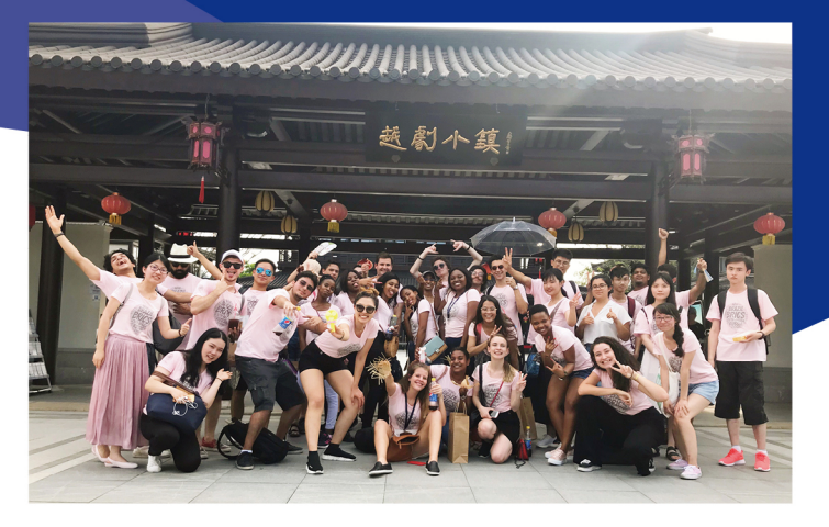
CULTURAL TRIPS AROUND SHANGHAI