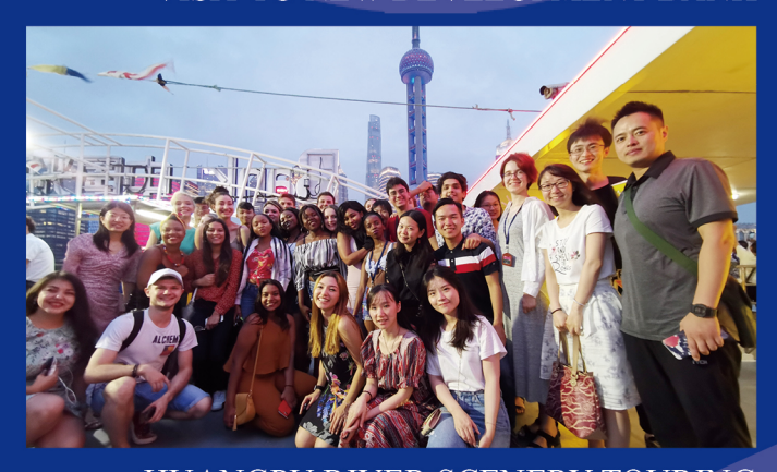
HUANGPU RIVER SCENERY TOURING